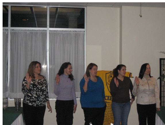
New Officer Inductions